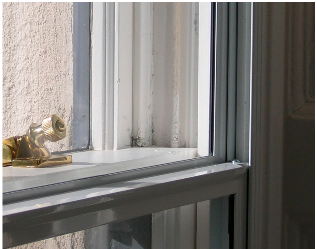
Figure 3: Secondary glazing can provide very effective draughtproofing as well as improved thermal efficiency.