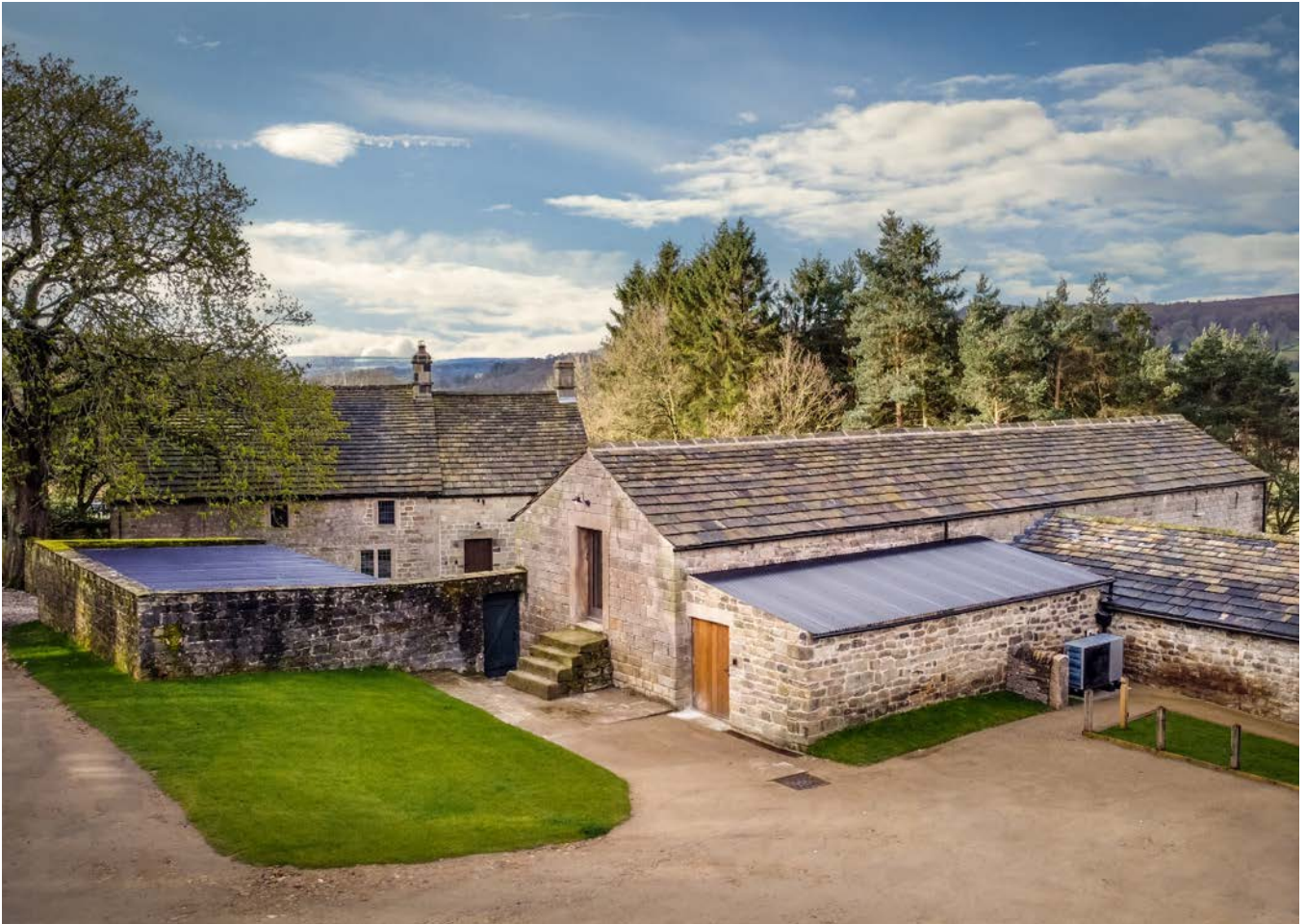
Figure 11: An air source heat pump has been installed in an inconspicuous location behind a barn next to the Grade II listed farmhouse.

95. See Historic England's webpages for further detailed advice on heating systems, including heat pumps.