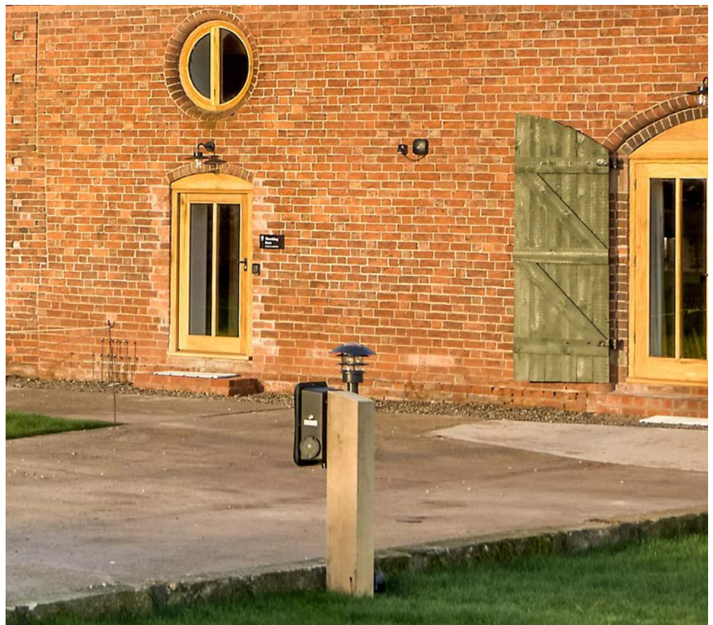
Figure 13: Freestanding electric vehicle charging point