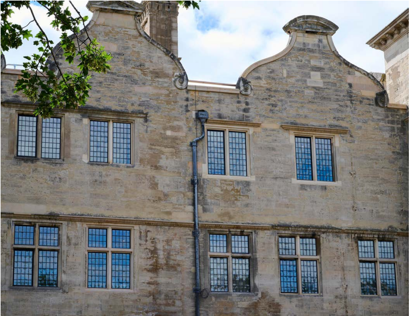
Figure 4: In this Grade I listed building, a number of existing metal-framed windows were replaced with either mono-laminated glass or slim-profile double glazing. Further information on this case can be found on the Historic England website .