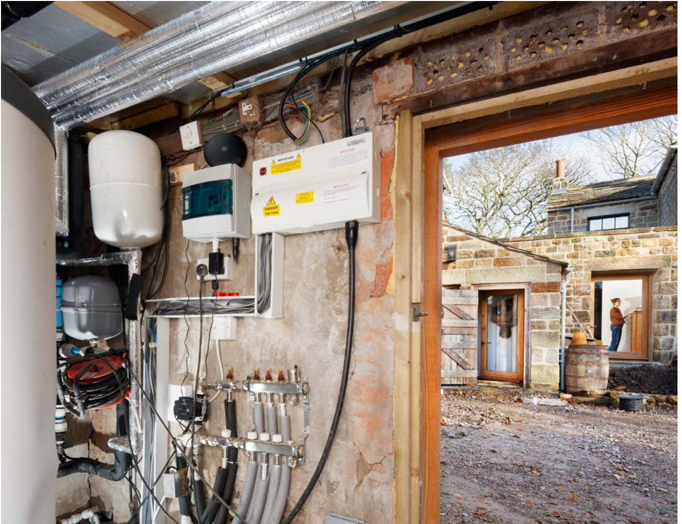
Figure 10: Interior of the outhouse at Hoggerstone Hill Farm, showing the ground source heat pump mechanics, with a view towards the converted farmhouse.