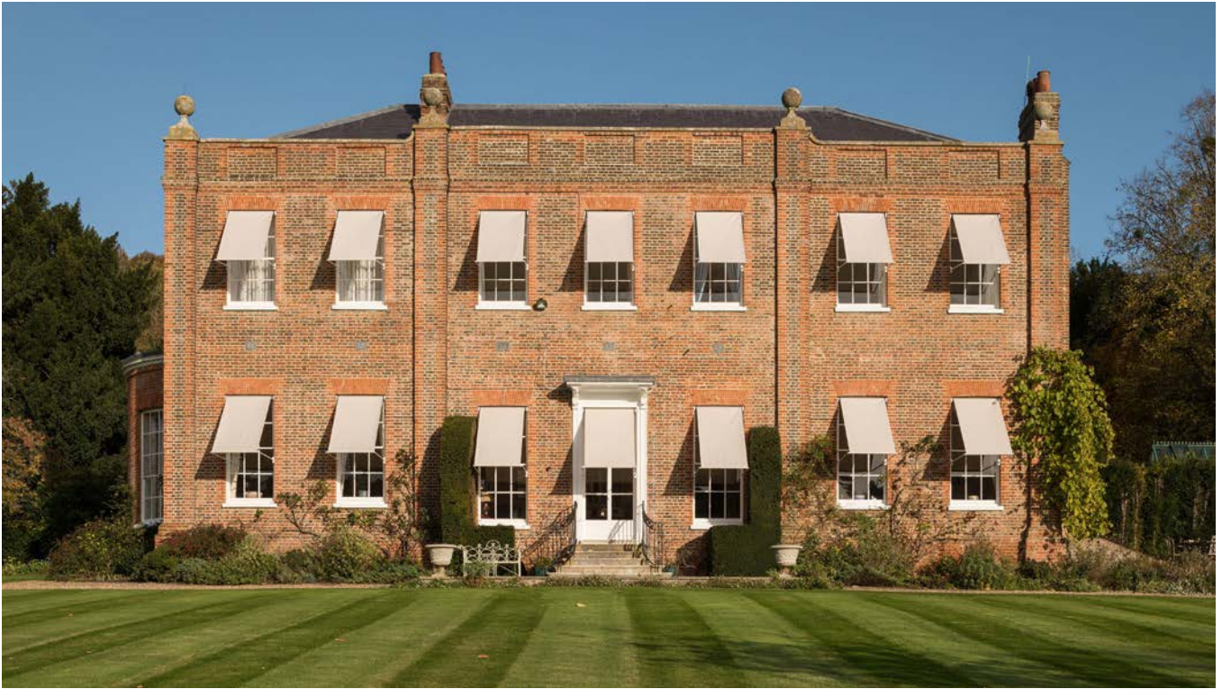
Figure 14: Rooms on the southwest elevation of this Grade II* house increasingly suffered from overheating in summer. Following identification of historic evidence for external awnings, new units have been installed. More information on this case can be found on the Historic England website .