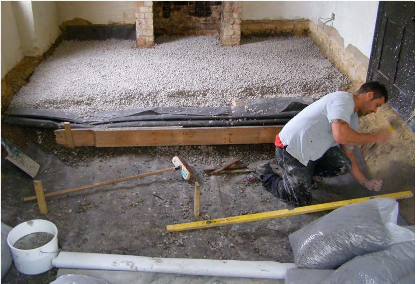
Figure 6: An insulated hydraulic lime floor being laid.