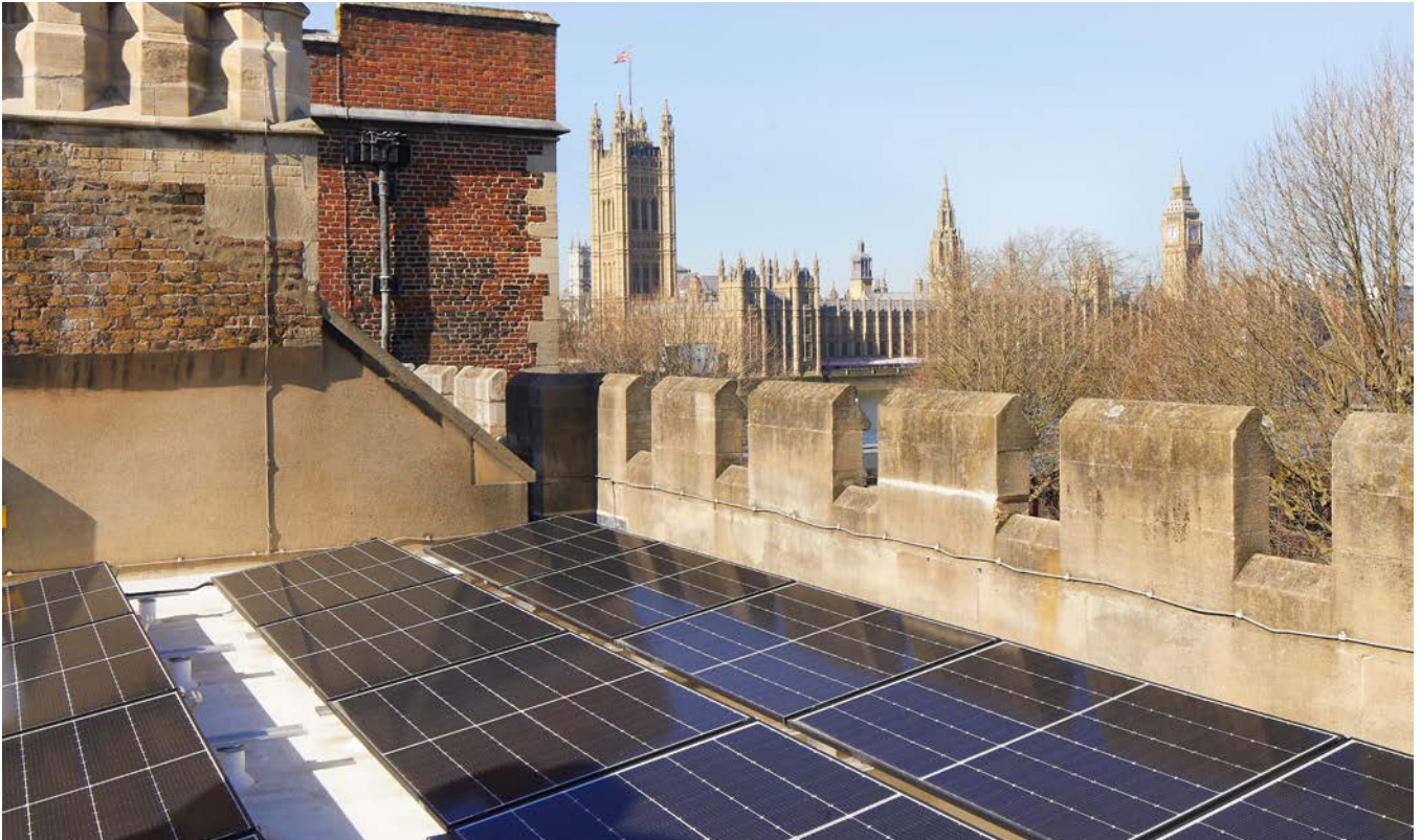
Figure 12: Solar panels installed on a flat roof behind a parapet at the Grade I listed Lambeth Palace.