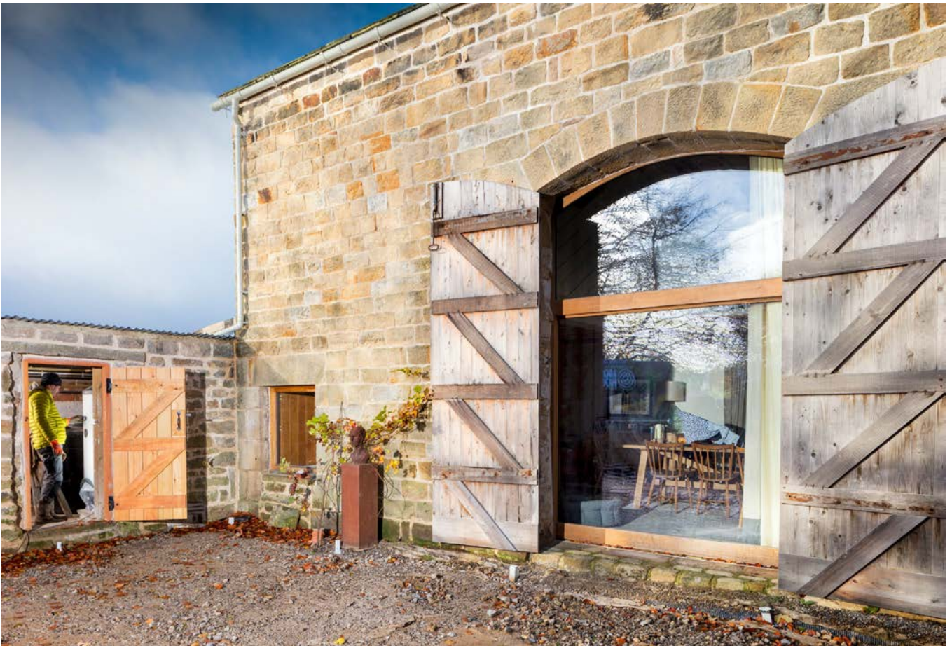
Figure 9: An exterior view of Hoggerstone Hill Farm, showing the converted barn and the outhouse containing the ground source heat pump.