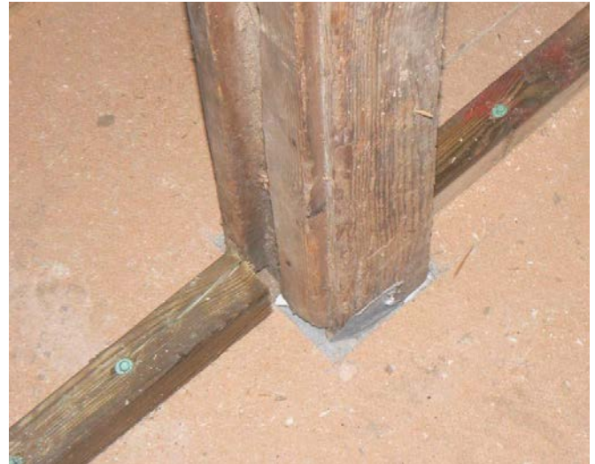
Figure 8: Insulation has been laid into the space between the floor joists.

Cavity walls were designed to prevent moisture ingress to the inner wall. As well as potentially settling, insulation can absorb moisture and, when saturated, transfer it to the inner wall. This risk is particularly high where a wall is more exposed to the elements