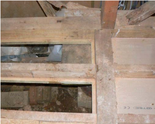
Figure 7: Battens have been added at the sides of the joists to support boarding to carry compressible sheep's wool insulation.