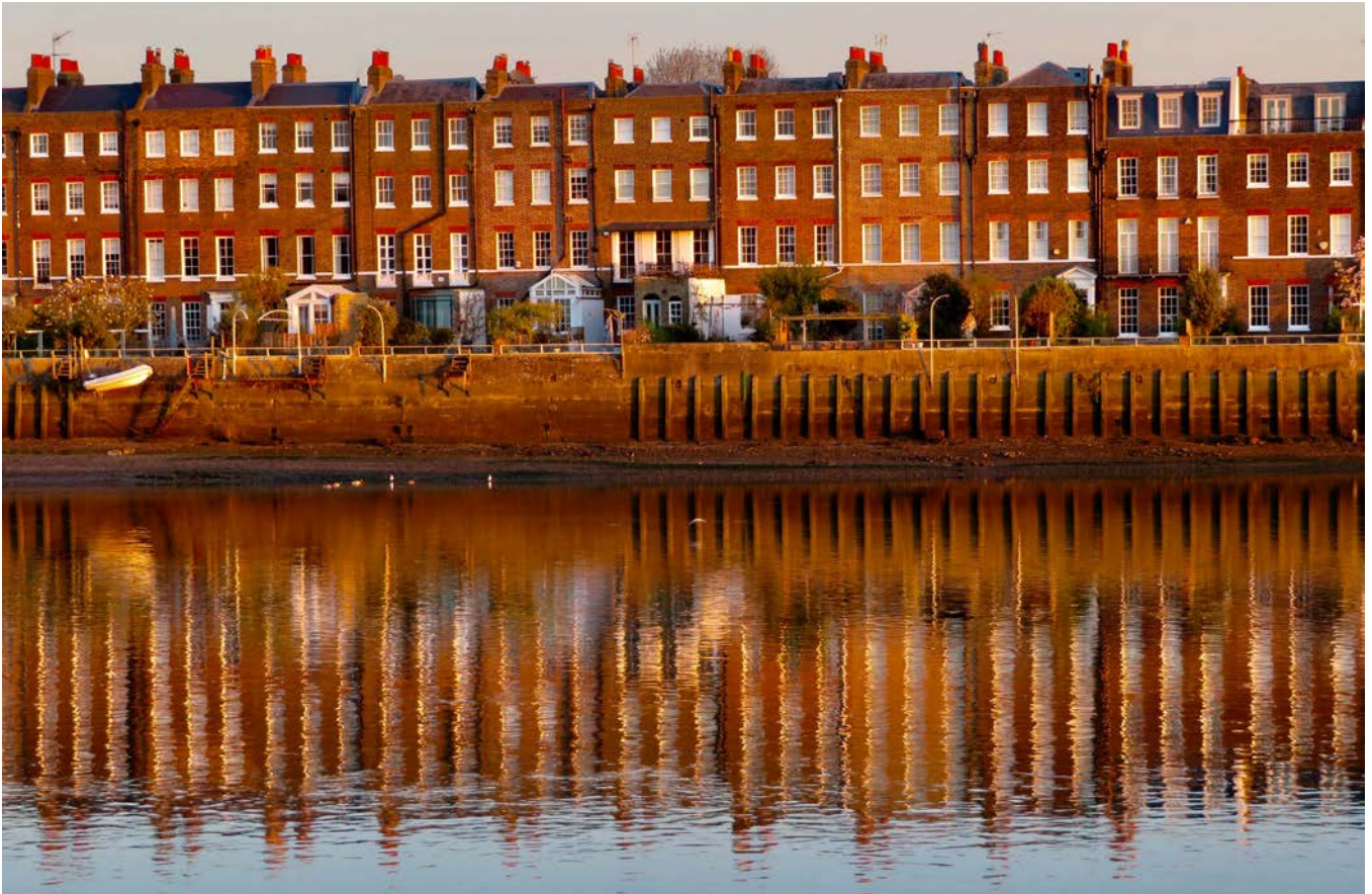
Figure 1: Understanding significance: a historic window may contribute to the significance of the listed building - both its interior and exterior appearance - and to the significance of neighbouring buildings and wider area of which it is a part.