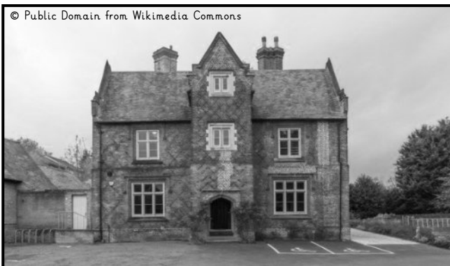
• Gippeswyk Hall, Ipswich