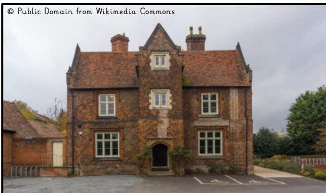
• Gippeswyk Hall, Ipswich