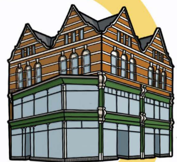
Pass & Co