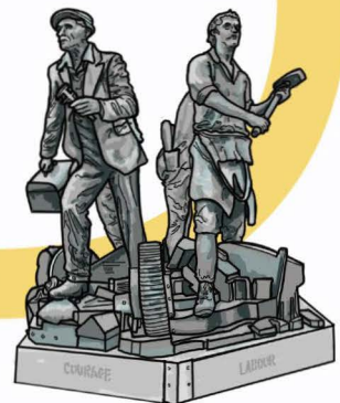
Spirit of Furness Statue