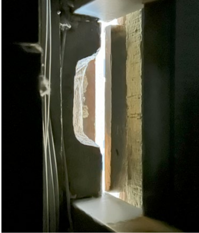
Gap around loft hatch for ladder/handle.