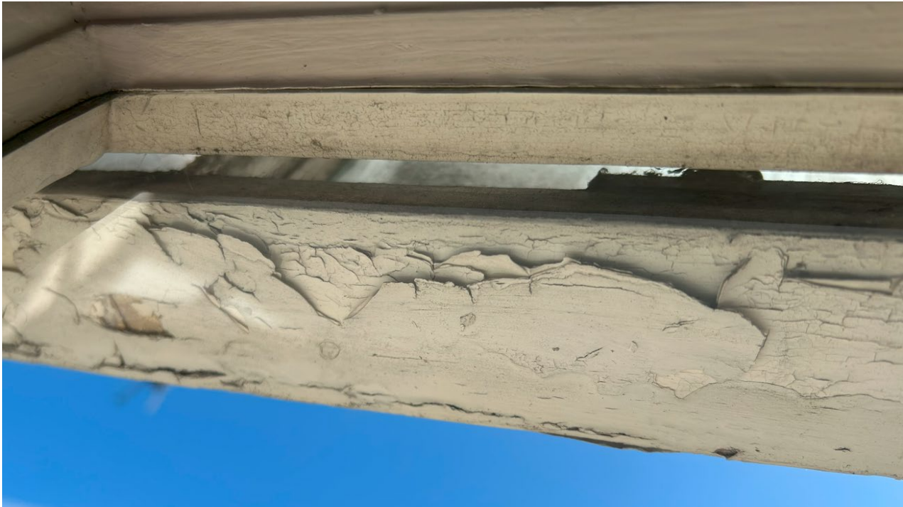
Figure A.2 Air leakage path

The window in staff area which had a gap at the meeting rail. The upper sash may have been slightly open. Not all windows were checked and there may be others in a similar state. Some windows had secondary glazing units fitted.