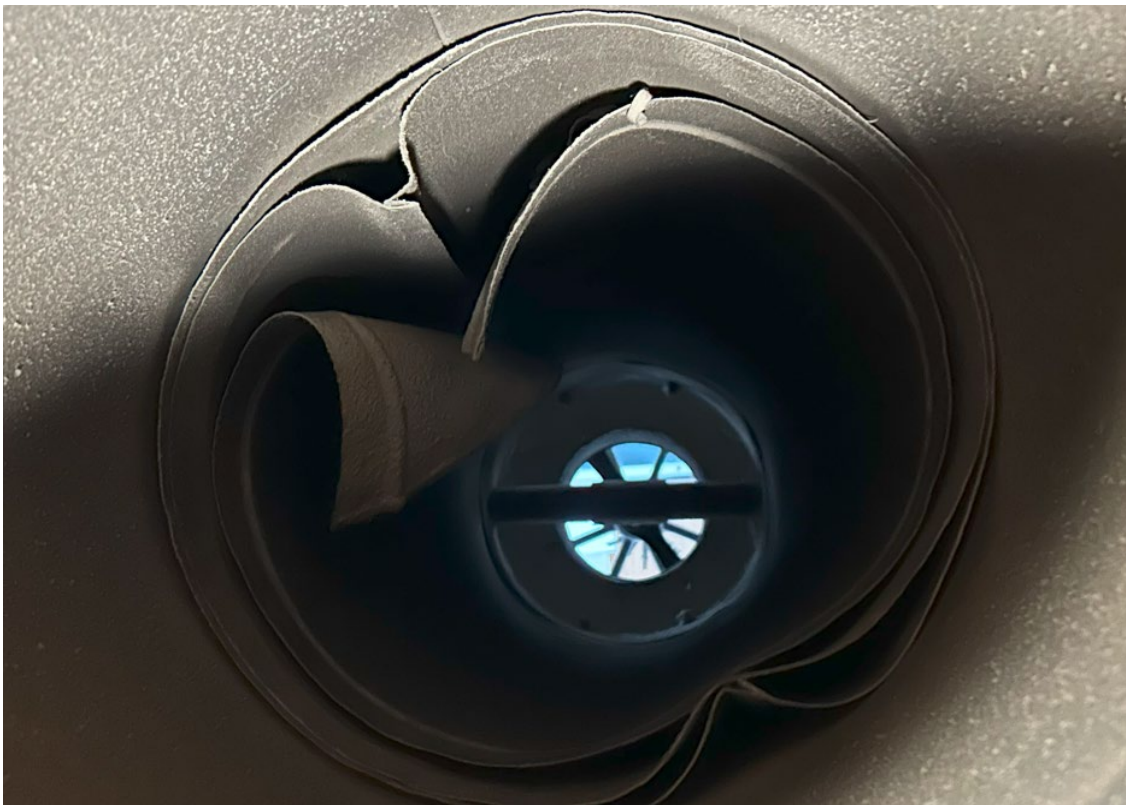
The unducted ceiling vent to the court room was open to loft space. The other ceiling vents were ducted to small MVHR units but were not temporarily sealed for the test.