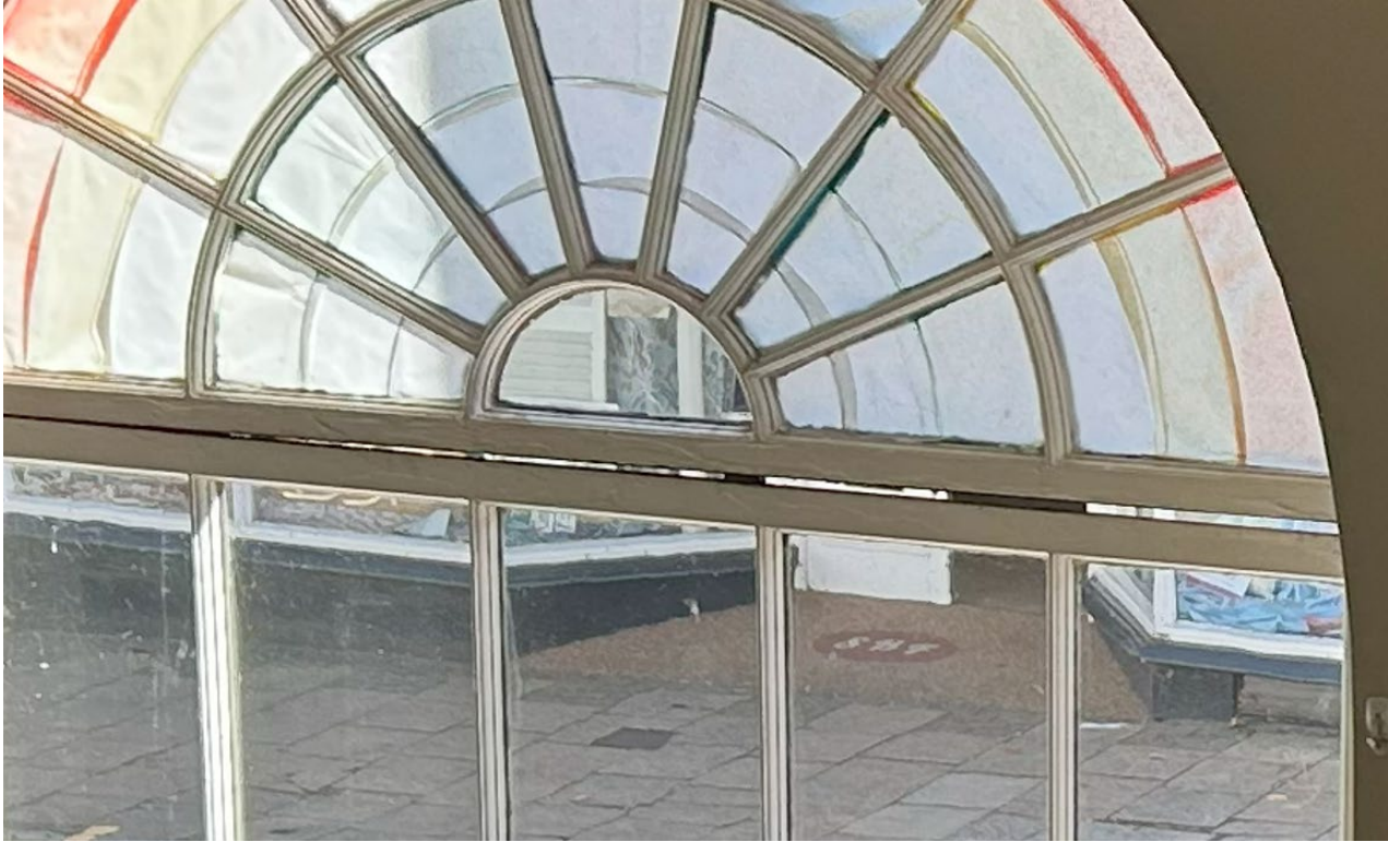
Figure A.1 Air leakage path

The upper window in the shop area was slightly twisted/open